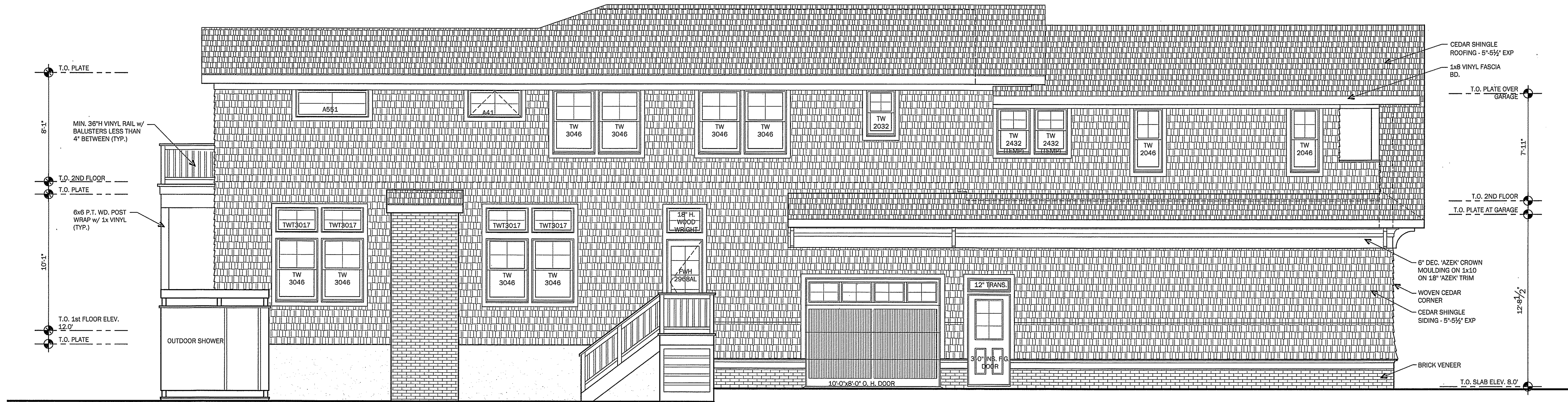
LEFT SIDE ELEVATION (WEST)