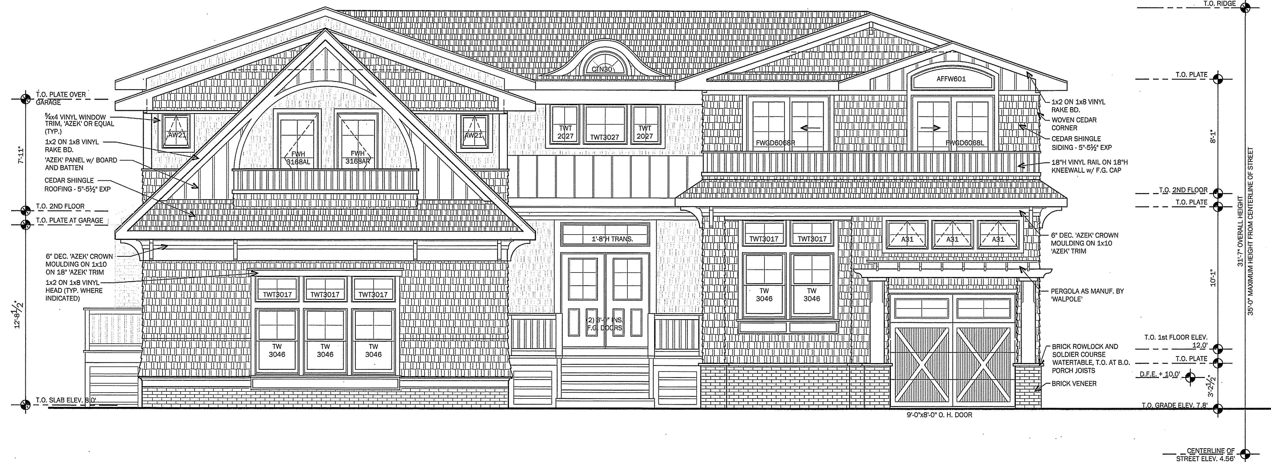
FRONT ELEVATION (SOUTH) - NELSON AVE