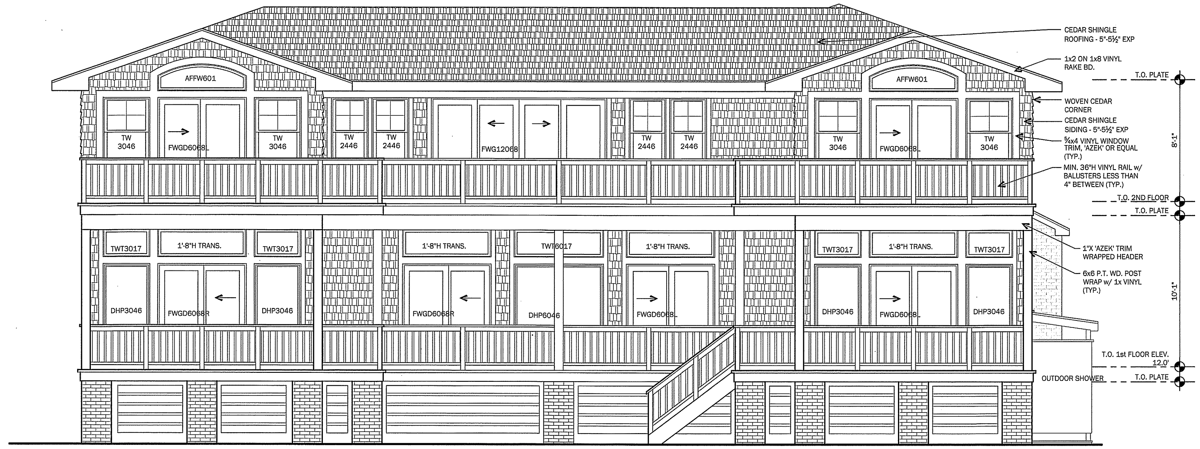
REAR ELEVATION (NORTH) - SUNSET LAGOON 1/4" = 1'-0"